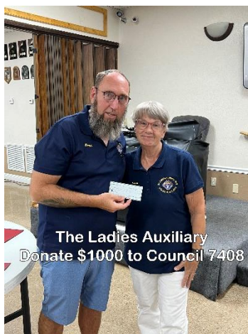
The Ladies Auxiliary Donate $1000 to Council 7408