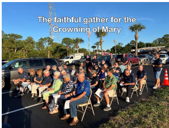
The faithful gather for the Crowning of Mary